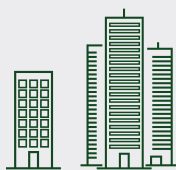
CONDOMINIUM Example: 10 floors 20 apartments

Now you only need to select from two different hydraulic models depending on the height of the building. Then you can create your booster set, with up to four pumps, to meet the demand.